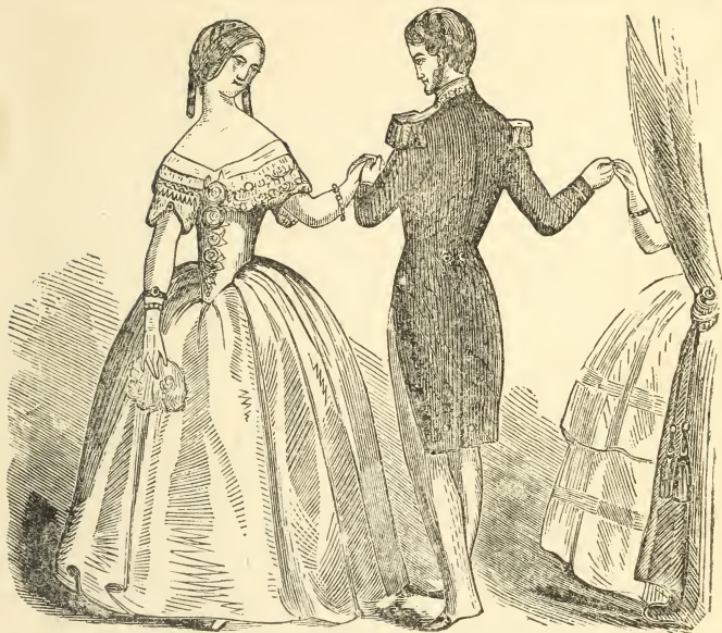
BALANCE FOUR IN A LINE.

After the sets are formed, the dance should in all cases commence with bowing and courtesying, first to partners, then to corners (this is to be done while the first strain of music is played), a strain of music in all cases in this work is understood to be eight bars of music, as most of the changes are performed during that time; but if a double strain of sixteen bars is introduced, it will be marked as two strains, and longer or shorter ones in proportion. In every other number in the set, except the first one, the dancers must rest until the first strain has been played through once; the first strain is then again played, at the commencement of which the first change must be called; then the second strain is played, and the next change is called — then the first strain, again and the next change is called — then the third and the next change is called — then the first again and the next change is called. If the figure commences with the first two or first couple, the above changes must be repeated four times, but if with the first four it must be repeated but twice only. The different changes should be called at the moment the music commences.